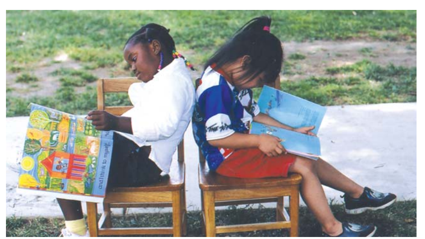
throughout their lifetime. In other words, we believe that such instruction might actually undermine, rather than promote, the very goals of improving literacy learning. In contrast to this trend, this article highlights the key principles of early literacy as defined in the 1998 International Reading Association (IRA) and NAEYC joint position statement "Learning to Read and Write: Developmentally Appropriate Practices" and from our understanding of what it means for quality early literacy practice.

We beg to differ. In fact, we argue that this type of instruction may inevitably consign children to a narrow, limited view of reading that is antithetical to their